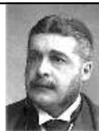
Sir Arthur Sullivan

Extracts from Gilbert and Sullivan operettas